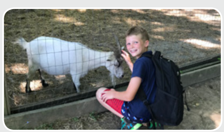
Brandywine YMCA, Camp Quoowant