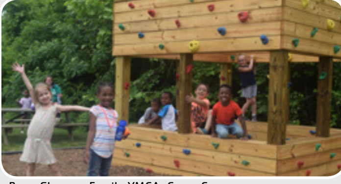
Bear-Glasgow Family YMCA, Camp Cassey