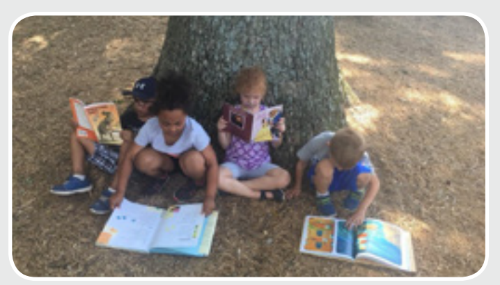
Dover YMCA, Camp Voyager