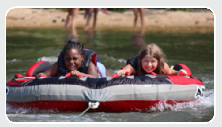
YMCA Camp Tockwogh