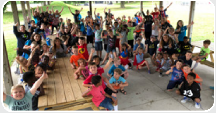
Middletown Family YMCA, Camp Silver Lake