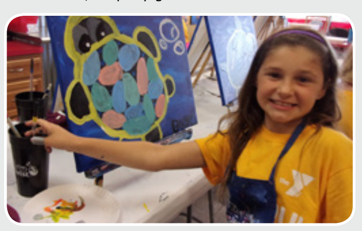
Western Family YMCA, Camp Wassaqui