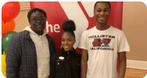
Teens from the Walnut Street YMCA Teen Workforce Development Program.

82 teens from the Walnut Street YMCA participated in the Workforce Development Program. Each teen received ten hours of training and participated in a 100 hour paid internship. Sixty-eight percent of the teens remained employed upon the completion of the internship.