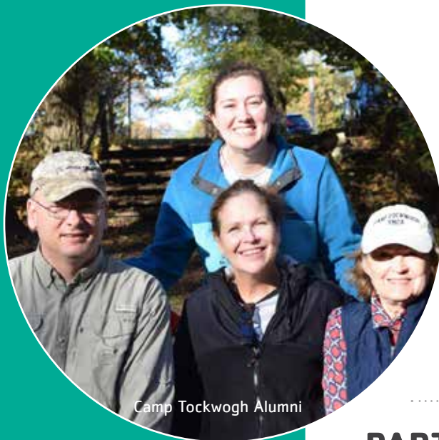
Camp Tockwogh Alumni