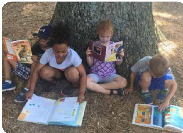
Campers at Camp Voyager (Dover YMCA) enjoying story time.

› 4,919 Children stayed safe and made lasting memories and friendships at Summer Camp.